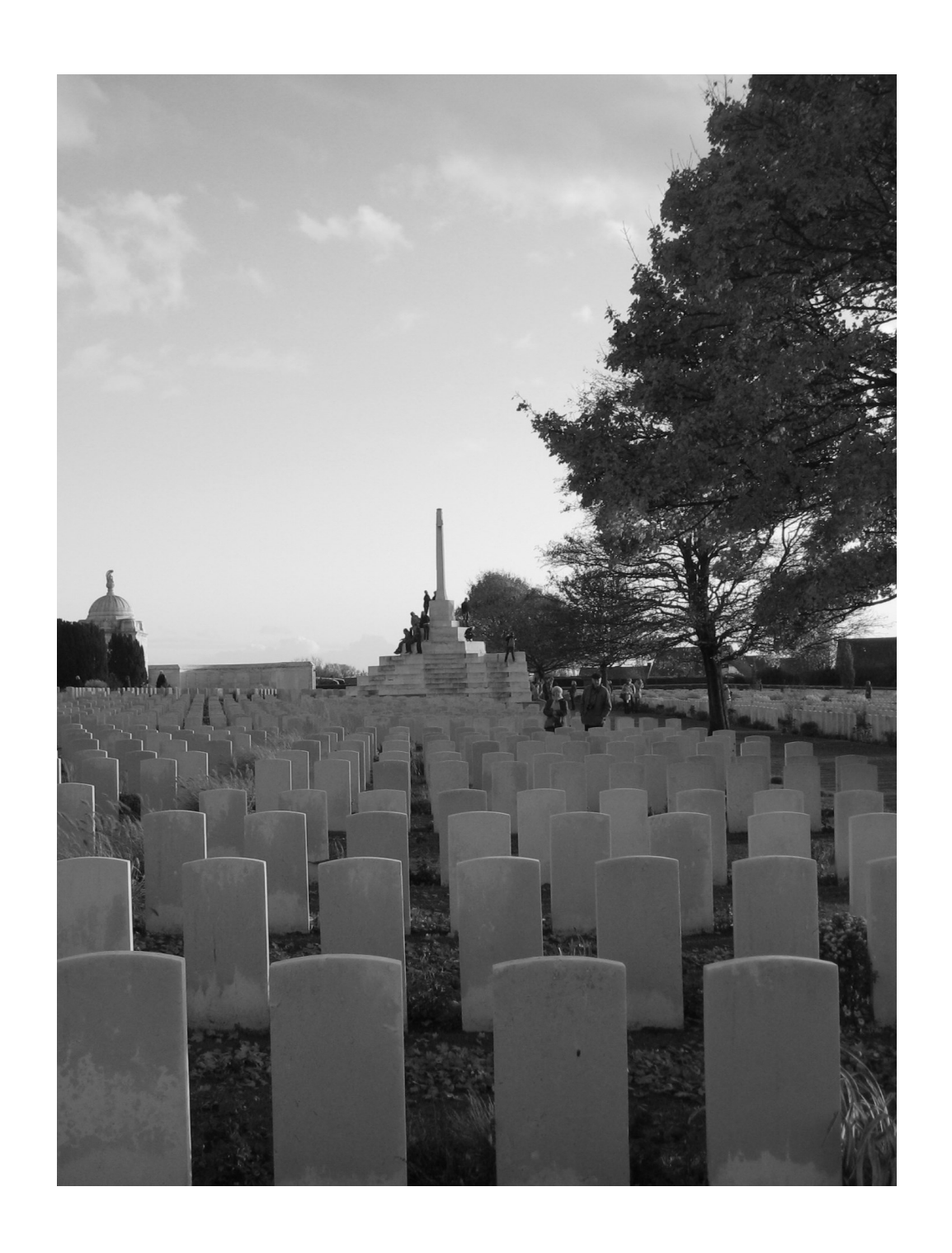
We will remember them